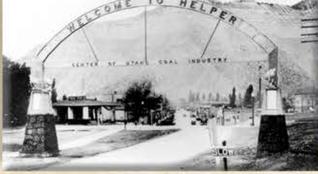
Helper circa 1930's