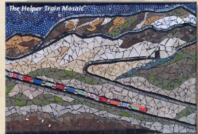
The Helper Train Mosaic