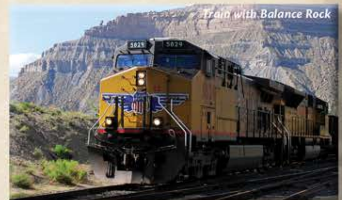
Train with Balance Rock

Also, make sure to stop by the mining equipment and museum yard to see the amazing machines used in the coal mines today. You will also see train cars and the Helper Train Mosaic.