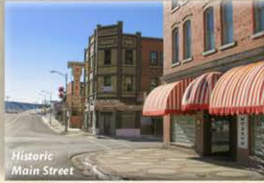
Historic Main Street