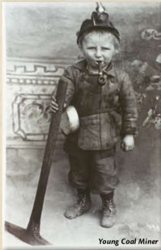
Young Coal Miner

At that time trains needed steam. Steam required coal, and mining coal required men. Soon immigrants arrived in Helper by the hundreds, searching for the "American dream." Italians, Greeks, Yugoslavians, Japanese, Slovenians and Chinese flooded the area. Many labored in the mines throughout Helper and the surrounding areas but some soon left mining to create businesses. Photos of Helper from the early 1900s show Greek coffeehouses, Italian bakeries, Japanese restaurants, Jewish and Italian mercantile stores together with saloons, billiard parlors, and hotels of all ethnic origins. By 1920, 27 different languages were spoken in Helper.