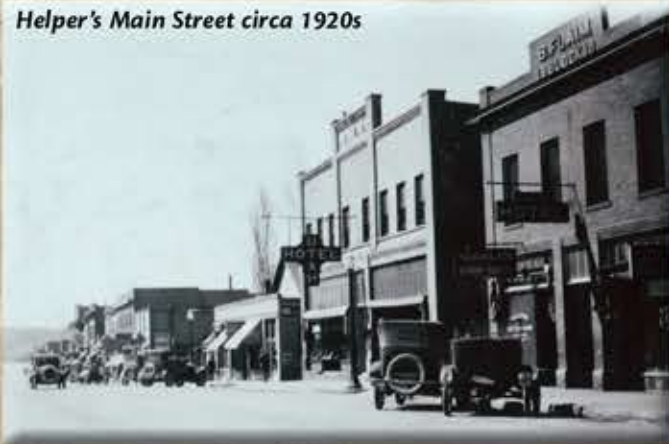
Helper's Main Street circa 1920s

Helper's name arrived with the railyard and its necessity of "helper" steam engines. These engines were attached to the trains traveling to Northern Utah, "helping" the trains with the steep grades found in Price Canyon.